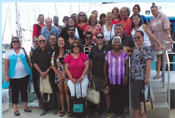
Referrers in attendance at the end of year workshop.

The Board are very grateful for the work the Referrers complete throughout the year and would like to thank them for all of their efforts throughout 2012 and previous years.