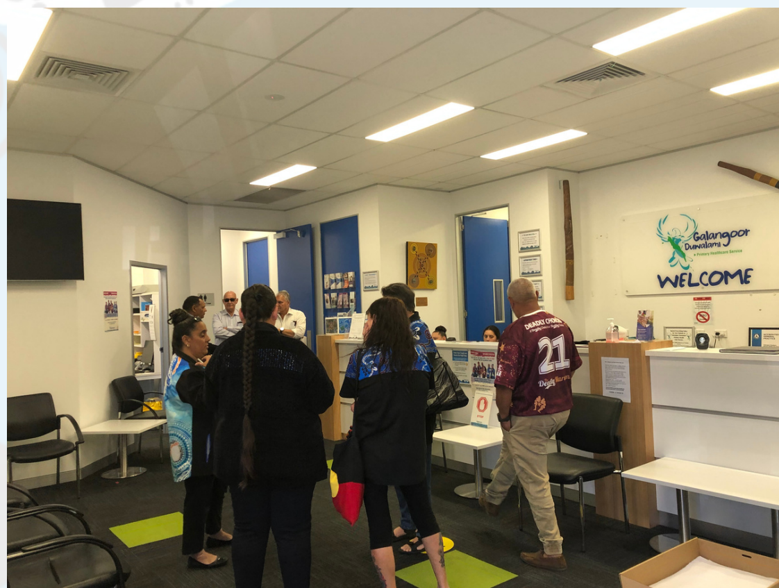
Galangoor AMS - Maryborough Board & CEO Visit