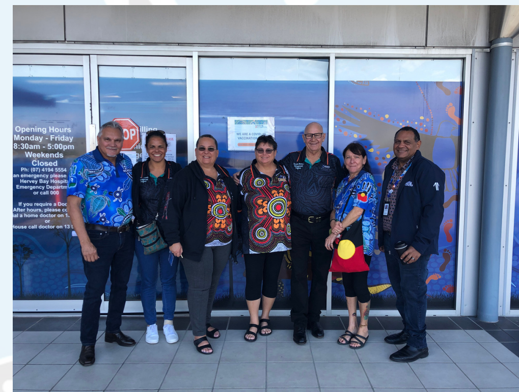
Galangoor AMS - Hervey Bay Board & CEO Visit