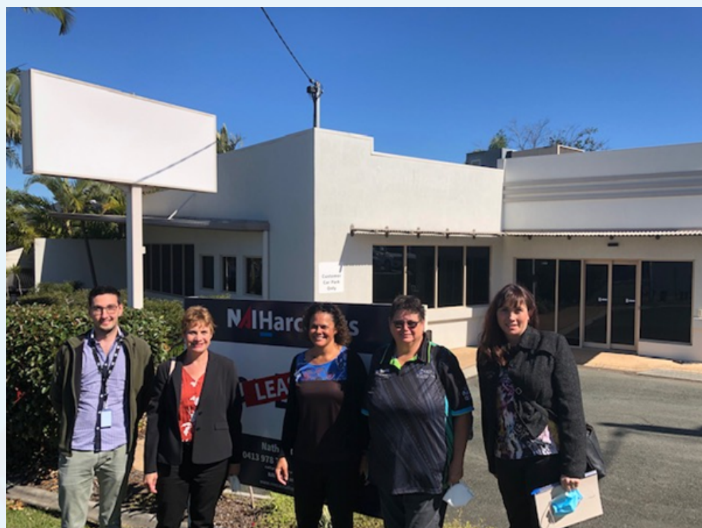
Gympie AMS Meeting with the Dept of Health