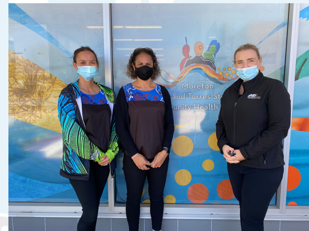
Moreton ATSICHS - Caboolture CEO & General Manager Visit