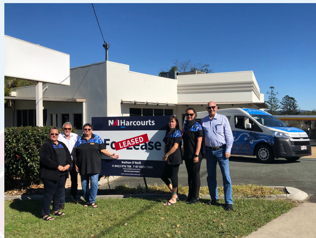
Gympie AMS Board Visit