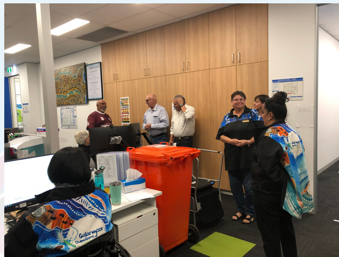
Galangoor AMS - Maryborough Board & CEO Visit